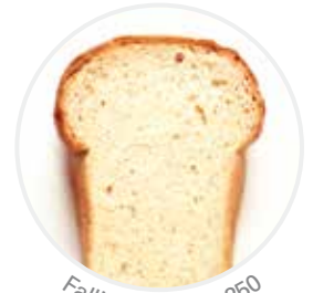
Falling Number 250